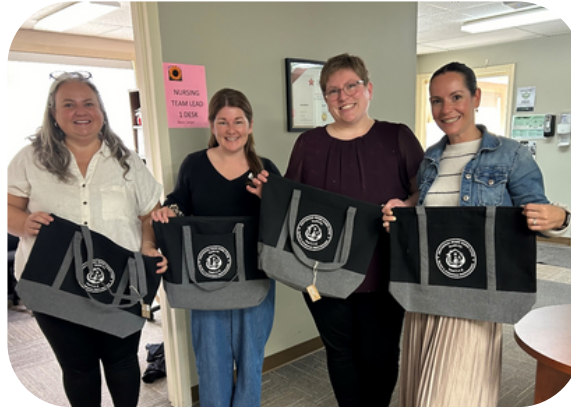
EAST PRINCE HOME CARE STAFF DISPLAY THEIR NEW BAGS

Exciting news! Home-Based Care Bags have landed. Swing by your site if you haven't snagged yours yet!