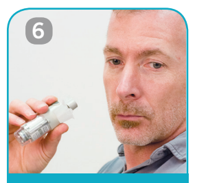
Hold breath. Breathe out.